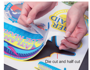
*The half cut function is Mimaki's proprietary technology