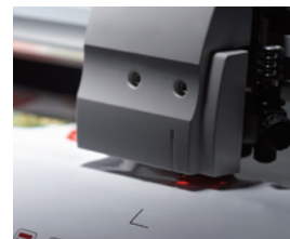
A light pointer easily adjusts the head position to the crop marks.

An optical sensor enables automatic consecutive detection of crop marks throughout the nested images. Together with the automatic adjustment function, it helps to achieve precise contour cutting.