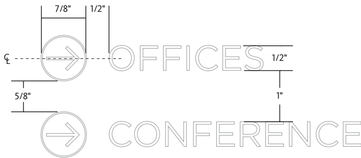
DETAIL Scale: NTS