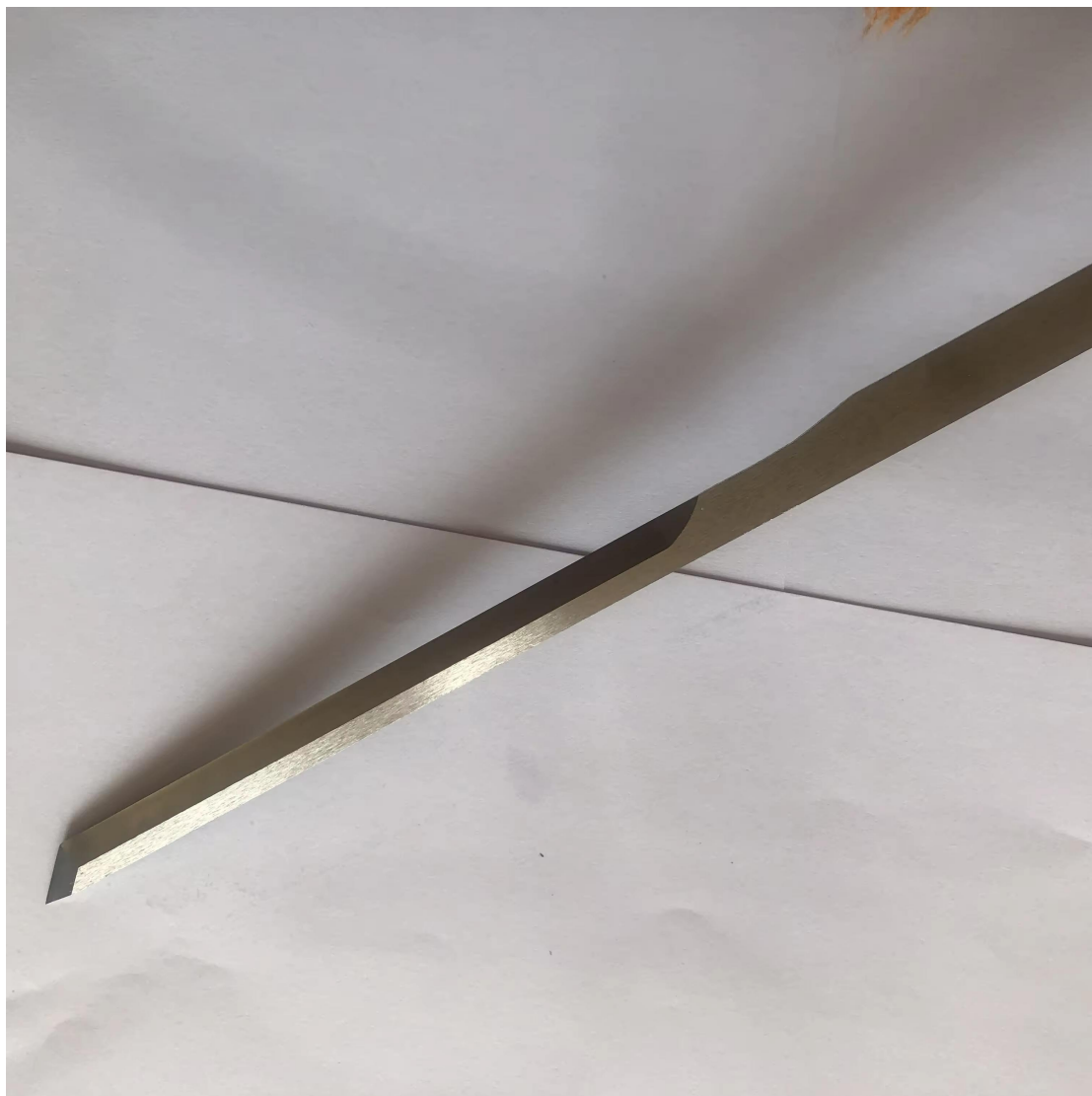
Automatic multi-layer CAD CUTTING BLADES/ 05-099A /For IECHO AUTO MACHINE