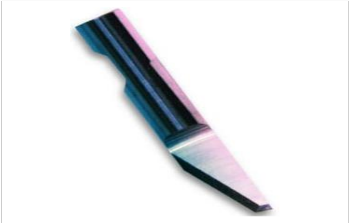
Axyz BT-57210 B1031I-10 Single Edge Flat Point Knife Blades