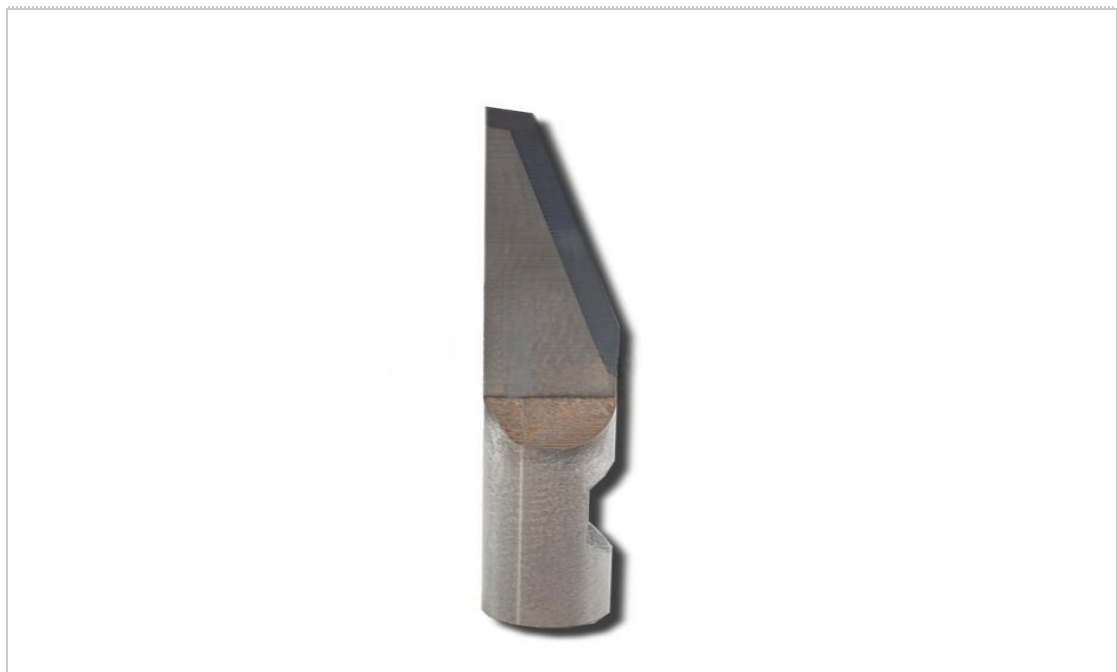
Multicam Bt-57210 Round Shank Knife Blades

Equivalent to: AXYZ B1031I-10, MultiCam BT-57210