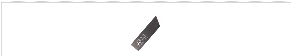
JingWei JWei Knives/Knife Blades J323