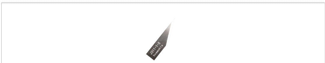
JingWei JWei Knives/Knife Blades J311-1-S