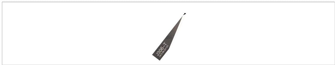
JingWei JWei J306-T J306 Knives Knife Blades

J341: Suitable for cutting 5-15mm Chevron board, KT, corrugated, etc.