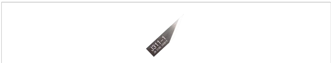
JingWei JWei J311-1 Knives Knife Blades