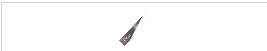
JingWei JWei Knives/Knife Blades J308