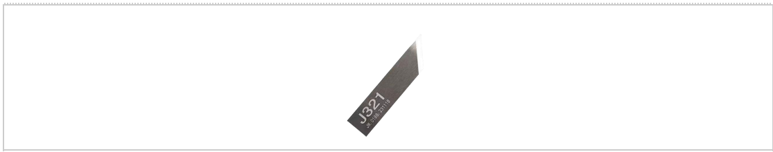
JingWei JWei Knives/Knife Blades J321