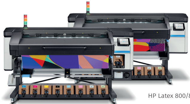
HP Latex 800/800W