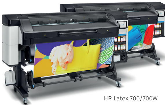
HP Latex 700/700W