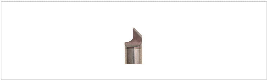
Esko Kongsberg BLD-SR8174 C2 Knife Blade G42470153