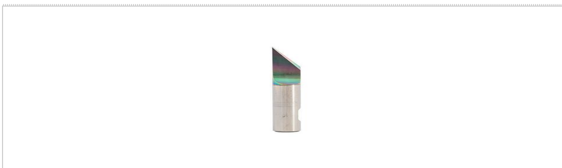
Esko Kongsberg BLD-SR8180 C2 Knife Blade G34118331