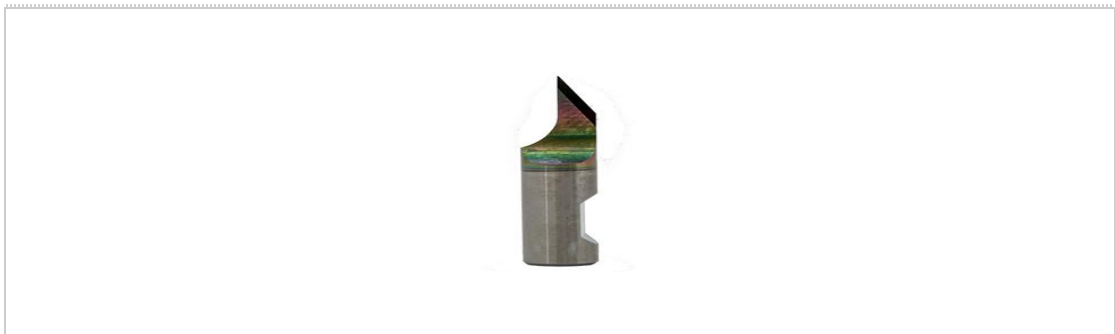
Esko Kongsberg BLD-SR6150 C2 Knife Blade G42475764