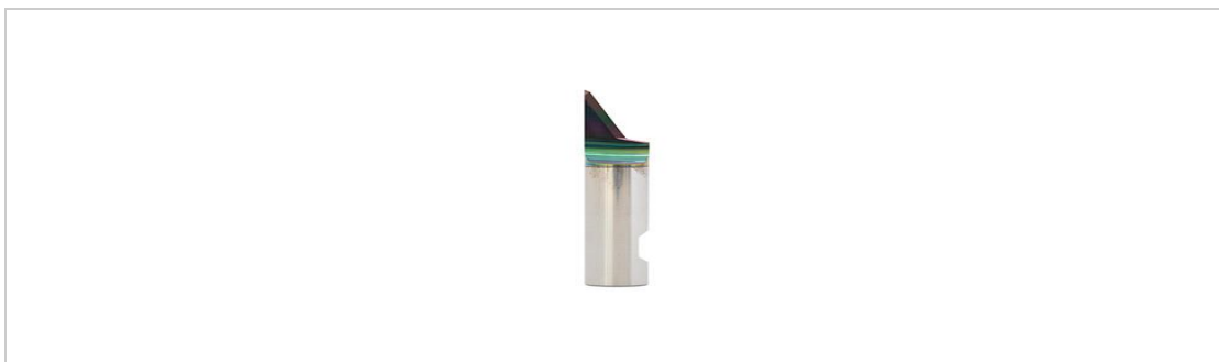
Esko Kongsberg BLD-SR8124 C2 Knife Blade G42475863