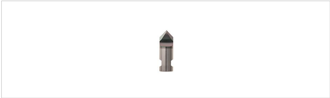
Esko Kongsberg BLD-DR8160 C2 Knife Blade G42475806