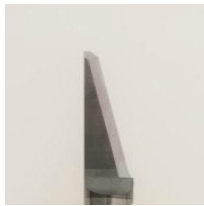
Esko Kongsberg Bld-SR6310 C2 Blade G42475798