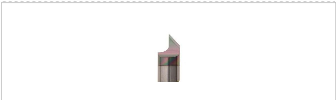
Esko Kongsberg BLD-SR8170 C2 Knife Blade G42475814