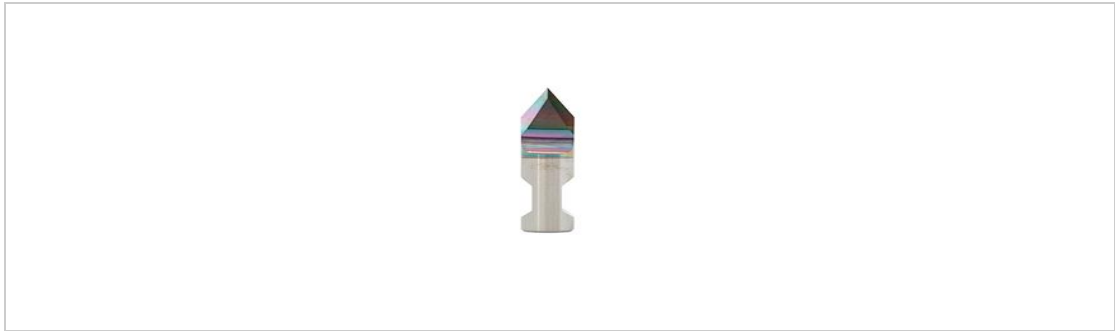
Esko Kongsberg BLD-DR6160 C2 Knife Blade G42475756