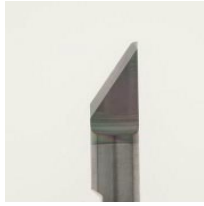
Esko Kongsberg Tungsten steel coating Bld-SR6224 C2 Knife Blade G42475780