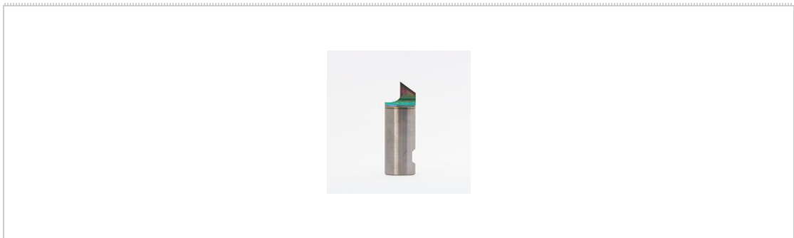
Esko Kongsberg BLD-SR8172 C2 Knife Blade G42475822