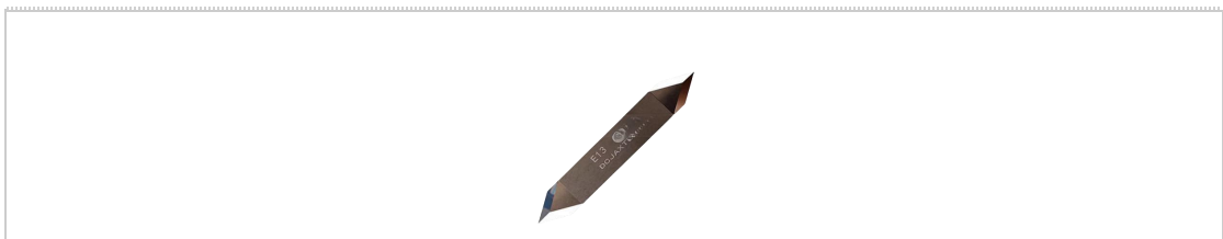
iEcho E13 Tungsten Carbide Double Ended Knife Blade