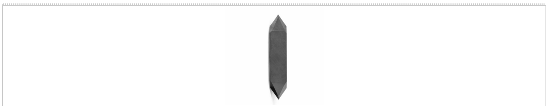
Zund Z13 Tungsten Carbide Drag Knife blade,flat-stock 3910321