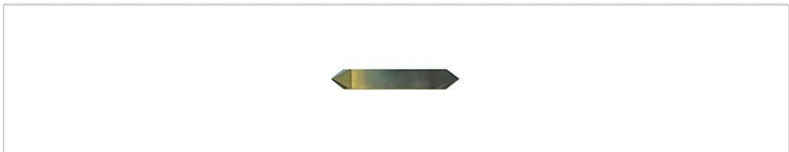
Comagrav E13 Drag Knife blade flat-stock