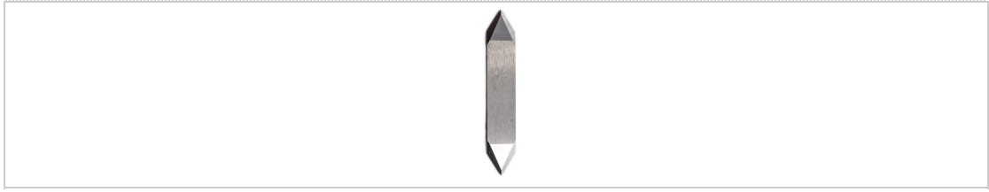
Esko Kongsberg BLD-DF213 Carbide Knife Blade T13,G42441204