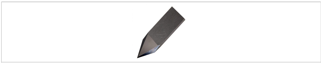
COLEX T00313 60° Double Edge Knife Blade