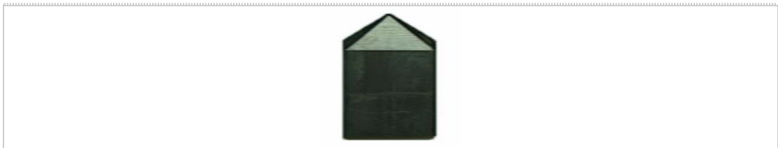
Multicam 60-degree Dual Edge Solid Carbide Wide Diameter Knife Blades(94-02466-910.309-S) K24