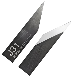
JingWei JWei Tungsten Carbide Knives/Knife Blades