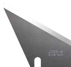
JingWei JWei J355-A J355-B V-cut Grooving Knife blade