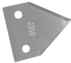
JingWei JWei J356 V-Cut tool,V-cut Knife blade