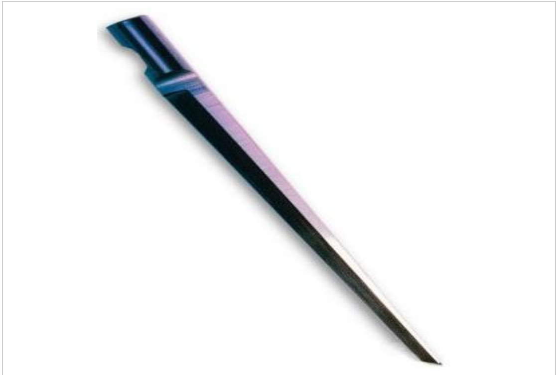
Multicam 84-00193-BT572065 Single Edge Flat Point Knife Blades