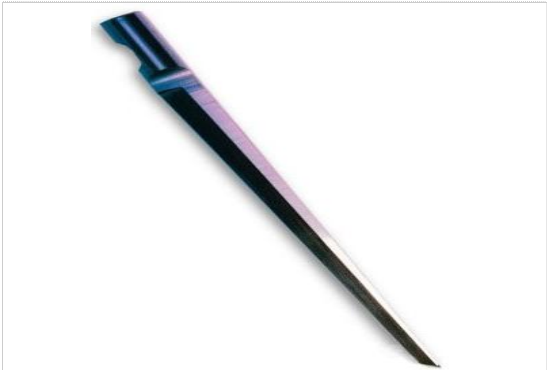
Axyz BT-572065 B1041L-65 Single Edge Flat Point Knife Blades