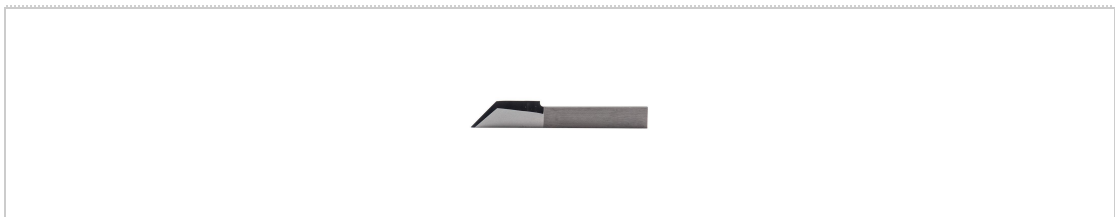
Aristo solid carbide Knife blades 4800.073-AR35