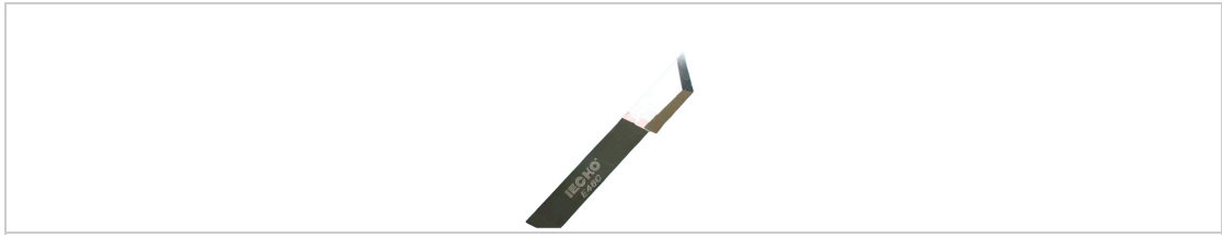
iEcho E46C Drag Knife Blade