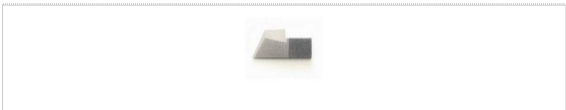
Comagrav E46 Drag Knife Blade