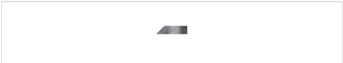
Blackman & White BW30 Carbide Drag Knife Blade