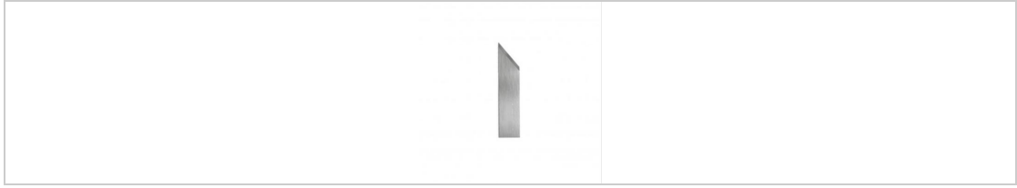
Zund G3 Z30 Carbide Drag Knife Blade 50° Cutting Angle for Matboards 3910330