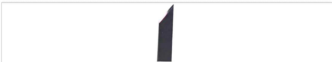
Esko Kongsberg Bld-Sf233 Drag Through Cut Knife Blade G42458380