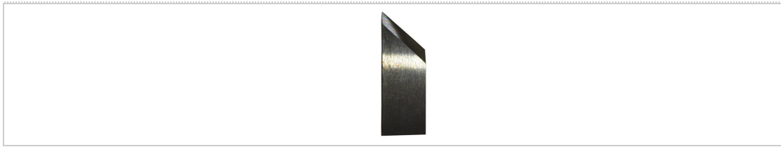
Zünd Z33 Passepartout/Mat-cutting Knife blade 3910333

Suitable for machine manufacturer: Zünd Z33 / 3910333 Esko BLD-SF233 (i-233) / G42458380 Mecanumeric COMPO008761 100610410