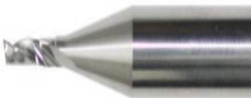
Zund Milling & Router Bits R112(3910762)