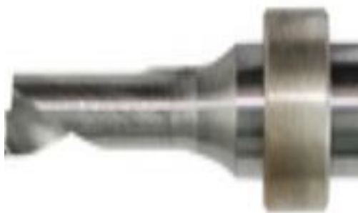
Zund Milling & Router Bits R204-A(5211436)