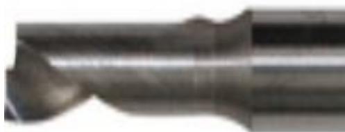
Zund Milling & Router Bits R205 5209421