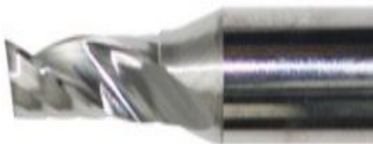
Zund Milling & Router Bits R114(3910764)