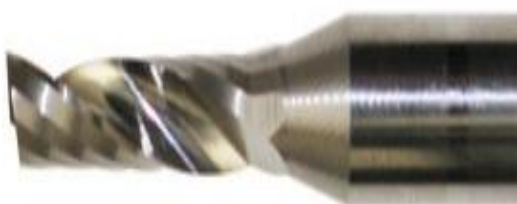
Zund R104 3910744 Spiral Milling bit Router Bits– Replacement