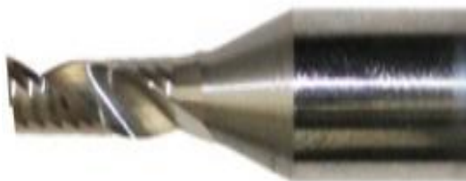
Zund Spitar Milling & Router Bits R103(3910743)