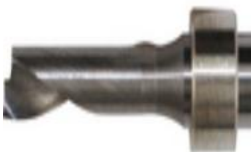
Zund Milling & Router Bits R205-A(5211437)