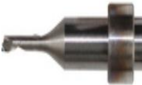
Zund With Stop Ring Multipurpose Milling & Router Bits R202-A(5211434)