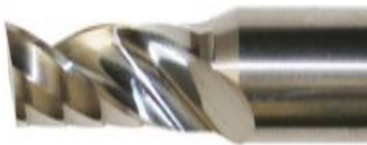
Zund Milling & Router Bits R115(3910765)