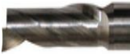
Zund Multipurpose Tungsten Carbide Milling & Router Bits R206(5209422)