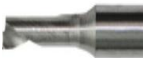
Zund Tungsten Carbide Milling & Router Bits R204(5209420)