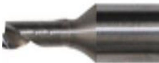
Zund Multipurpose Milling & Router Bits R203(5209419)