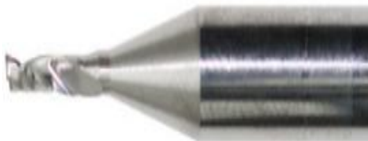
Zund Milling & Router Bits R102(3910742)