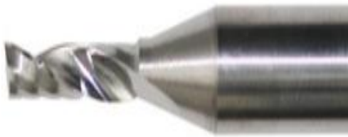
Zund Milling & Router Bits R113(3910763)