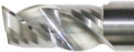
Zund Milling & Router Bits R100(3910741)