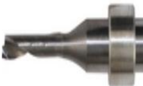
Zund Milling & Router Bits R203-A(5211435)