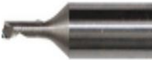
Zund Tungsten Carbide Milling & Router Bits R202(5209418)