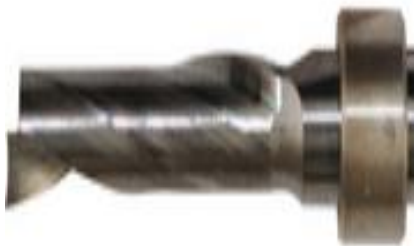
Zund R206-A With stop ring Milling & Router Bits (for use with ARC) 5211438